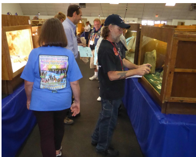
Visitors enjoying the exhibits at the 2017 CFMS-AFMS Show

For those of you entering exhibits, set-up takes place Noon to 8:00 PM the day before the Show, on Thursday, May 23. Show hours are then 10:00 AM to 5:00 PM on Friday and Saturday, May 24 and 25, and 10:00 AM to 4:00 PM on Sunday, May 26. The Cracker Barrel and official show welcome takes place Friday at 7:00 PM (where we'll host a small silent auction to benefit the CFMS Endowment Fund), and the Awards Banquet starts with a Happy Hour at 6:00 PM, Saturday, May 25. To see the locations of the various events and the schedule in full, again, turn to the show website. Then fill the tank with gas and/or plug in your e-vehicle, and make plans to hit the road to enjoy the beach at seaside Ventura!